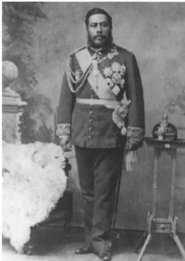
KING DAVID KALAKAUA

Between 1880 and 1891, during the reign of King David Kalakaua, a total of 18 young Hawaiians were sent overseas to study as part of the "Hawaiian Youths Abroad Program." The goal of the program was to train the young Hawaiians so that they could be of service to their King and country. The locations selected were Italy, England, Scotland, China, Japan, and the United States. The participants were personally chosen by King Kalakaua and included 17 men and one woman studying diverse subjects such as engineering, medicine, art, music, military science, and foreign languages. Of these 18, five were sent to Italy.