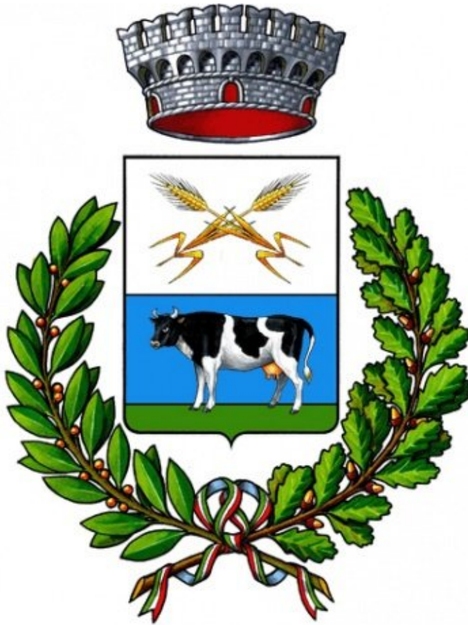
The crest of San Potito Ultra, province of Avellino, Campagna